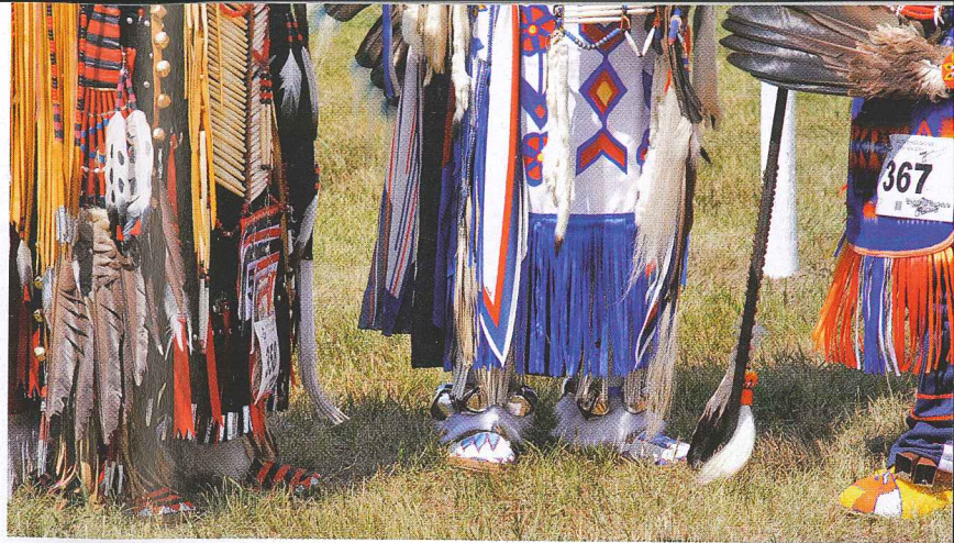
Powwow competitors wait in beaded and feathered finery for their turn to perform.

There's a mere smattering of curious tourists in the bleachers amid families quietly cheering on their loved ones. The few stalls dotted around outside the marquee offer an odd mix of the traditional and the new: bannock and bologna sandwiches, feathered cowboy hats, Northern Plains powwow music CDs, a few beaded necklaces and those ubiquitous South American woven blankets.